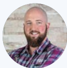
MEDICALLY REVIEWED BY: Peter Woznik, ND, MSc Medical Writer, Fullscript